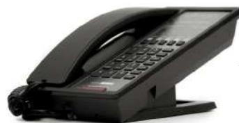
3.5 in (H)

Click on any image to be directed to our website.